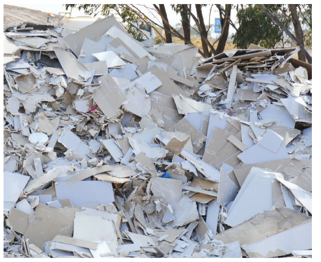
Plasterboard $60 per M<sup>3</sup>