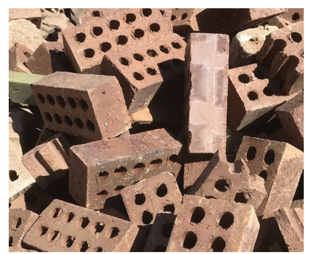
Bricks $40 per M<sup>3</sup>