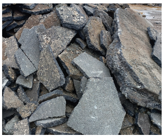
Asphalt $40 per M<sup>3</sup>