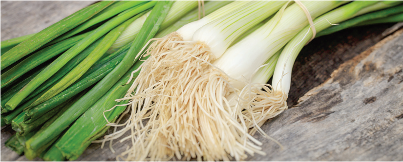
Grow your very own Spring Onions.

Now is the perfect time to plant your vegies and bulbs to enjoy the benefits come Spring.