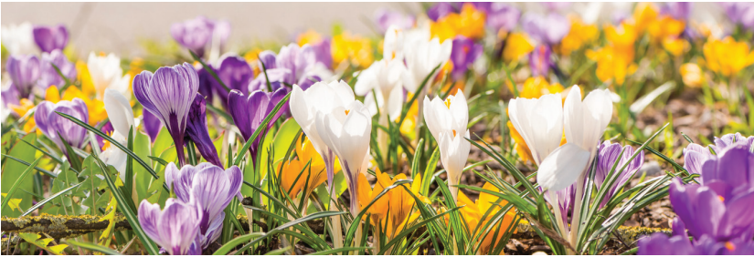
Get your bulbs in now to enjoy a splash of Spring colour.