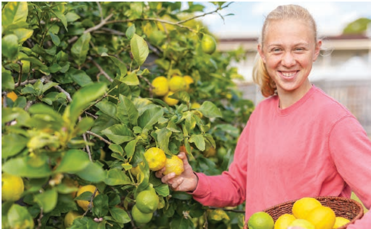
Now is the time to plant your citrus trees.

Get outdoors in the garden and enjoy the autumn colour!