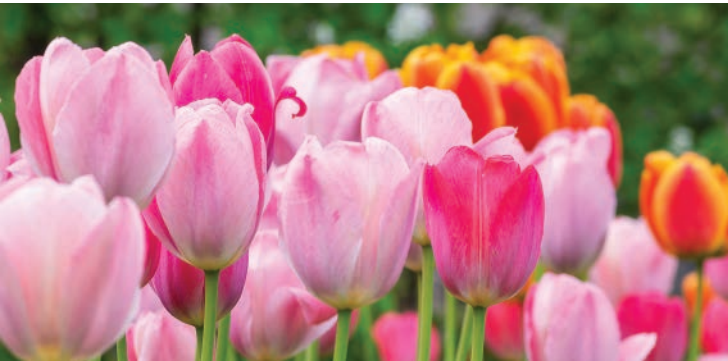
Plant your bulbs for gorgeous tulips this spring.

The cool autumn mornings have arrived but the soil temperature in our gardens continues to hold its warmth throughout the day. Now is the perfect time to enjoy the colours of the late autumn foliage and get outdoors and plant a few citrus trees.