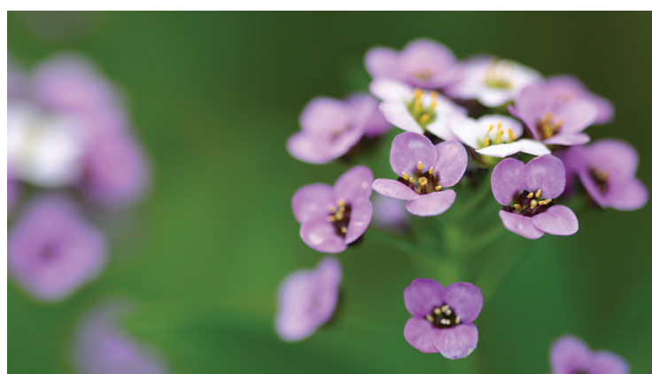
Alyssum add a pretty splash of colour to any garden.

Some of our favourite summer flowers include alyssum, foxgloves, impatiens, marigolds, petunias, snapdragons and vincas, just to name a few!