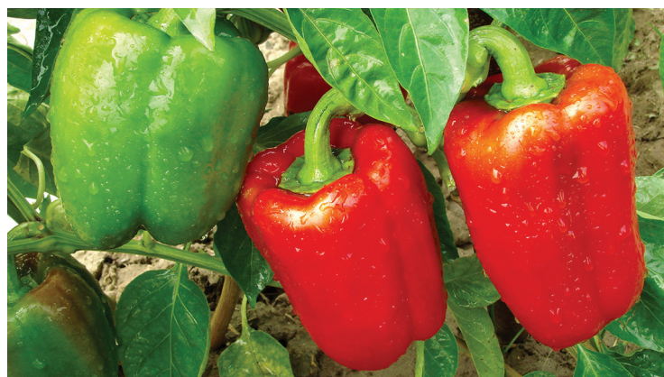
Capsicums make a great addition to stirfrys and summer salads.

Pick a beautiful sunny day and get stuck into the garden, from planning, pruning, and planting, there is plenty to do with Christmas just around the corner, before friends and family start arriving.