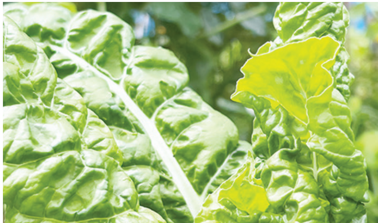
It's the perfect time to plant your silverbeet.

Now is the perfect time to get out into the garden and plant your flowers for spring colour, give your lawn a feed and prepare to plant your summer veges.