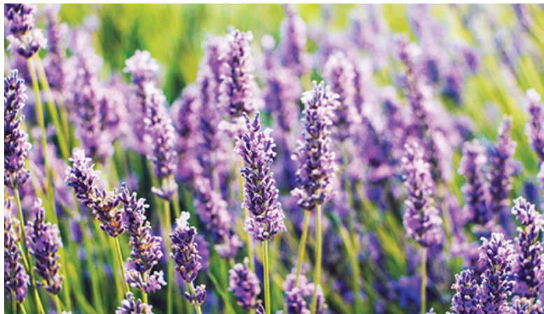
Lavender makes a wonderful fragrant addition to the garden.

If you want to add some spring colour to your garden, plant your dianthus, geraniums, lavender, marigolds, petunias and snapdragons! Have you checked out the gorgeous Princess Lavender with its vibrant pink flowers. It is a stunning, low maintenance and very versatile plant.